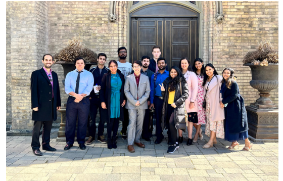
Oshawa Catholic Chaplaincy was the largest chaplaincy group in attendance at the Cardinal's Mass for graduating campus ministry students. Way to rep our chaplaincy and GTA east friends!