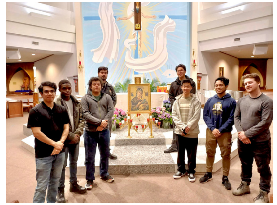
Mary's Monastery Men's Group

For the month of May, our Chaplaincy is holding a donation drive! We will be collecting baby items (clothing, diapers, toys, formula etc.) as well as gently used women's items (clothing, shoes, jackets, toiletries) and gift cards for the Sisters of Life. Please drop off all donations during office hours at the front office or kindly place on the white tables on Sundays in the Fr. Gignac Room. See above for Packing Party details. Thanks friends!